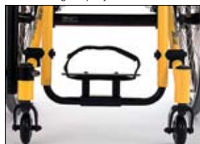
Adjustable Angle Footplate with risers option available for short leg lengths.