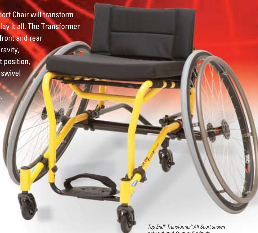
Top End® Transformer™ All Sport shown with optional Spinerge® wheels.