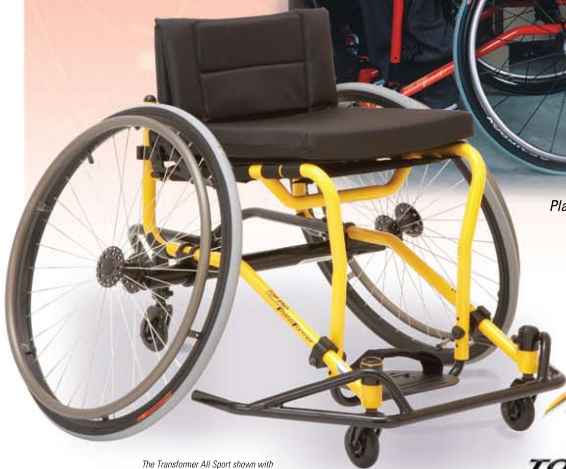
The Transformer All Sport shown with removable offensive wing.