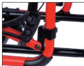
Adjustable rear seat height is independent of center-of-gravity adjustment.