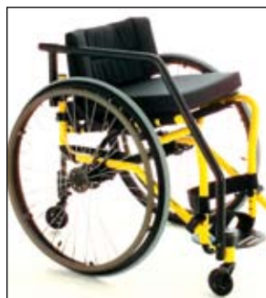
Removable Fencing arm option.