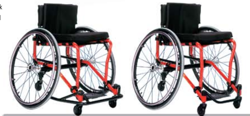
The Transformer All Sport shown with removable offensive wing for an offensive set-up.