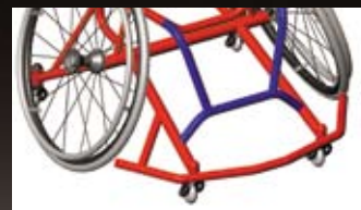
Double amputee front-end option.