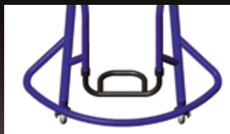
Round wing with round gussets for smooth turning.