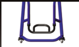
Bumper/omit wing for a more defensive setup.