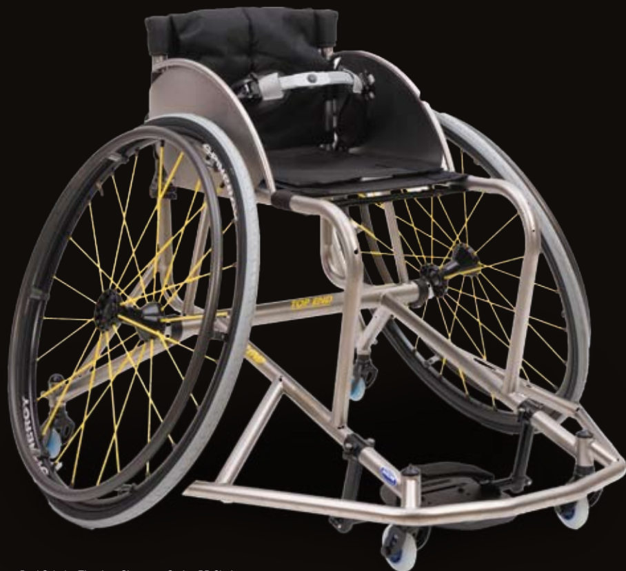
Paul Schulte Titanium Signature Series BB Chair shown with optional double swivel anti-tip, click straps and Spinergy® Spox Wheels.

Fast breaks, back picks and finger rolls. Get your team to the next level with the Invacare® Top End® starting lineup of performance basketball chairs.