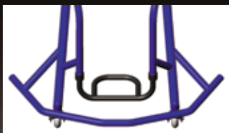
Four bend wing. Compact and great for dribbling.