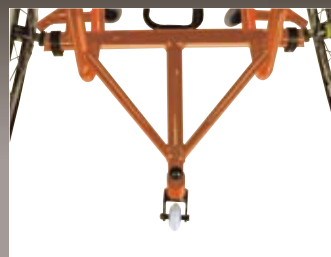
Adjustable height fixed single swivel anti-tip/fifth wheel is standard.