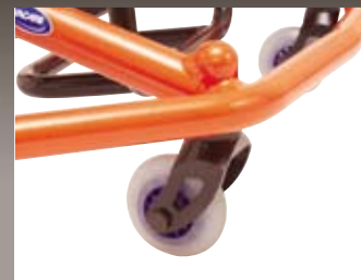
Smart fork system featuring inset bearings for fast and smooth turning. No caster caps to fall off.